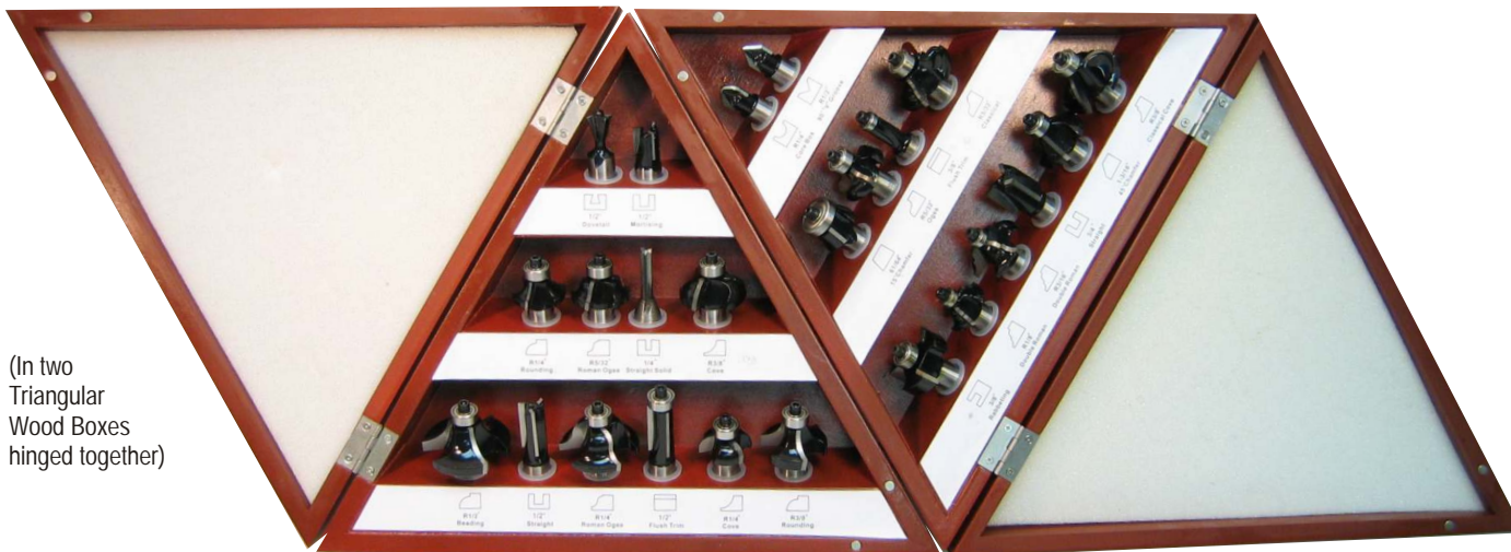
(In two Triangular Wood Boxes hinged together)