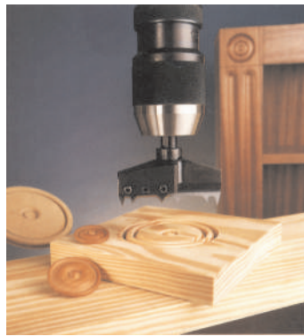
Rosette bit and cutter head require two knives.