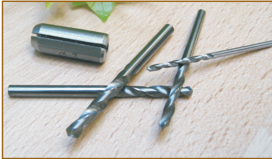
For HSS Jobber Drills see page 195